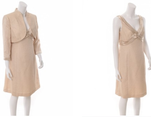
Figure 3 Day and Night Dress

Here, 'a Multi-Wear Clothing', not merely means old clothes for re-processing and reuse, yet it covers finished garments with more functions, more kinds of worn. With the fast pace of life and work, for the need of communication and etiquette, a part of the consumers' clothing need to change at different times at different stages in a day. As illustrated in Figure 3, the popularity of transfiguration day and night dress meets the need of white-collar ladies' work during the day and night at the reception.