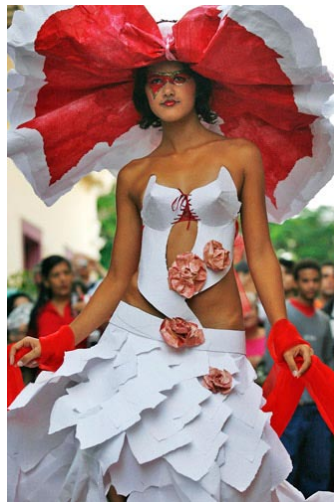
Figure 4 The Clothing Made by Recycled Paper

Secondly, Conceptive Clothing, which is green environmental protection clothing with the distinct DIY characteristics. Although insufficient utilization, it actually has manifested the designer and the populace using environmental protection materials, by the handwork, to participate in and support environmental protection enterprise. As illustrated in Figure 4, Havana, the capital of Cuba, at the anniversary of celebrating to construct the city 488 th , some artists take the fashion exhibition of characteristic environmental protection, which the clothing is made by recycled paper.